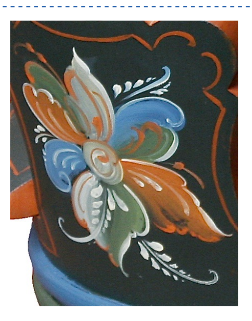
Traditional Telemark flowers