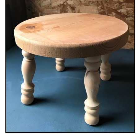
Baby stool - new 11"w x 8 1/4"h